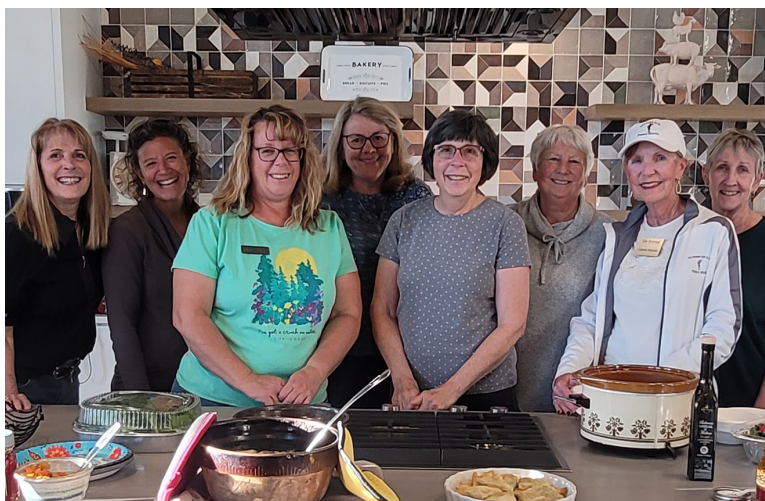
Garden Club Pot Luck