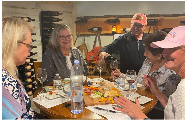
Brush Hallow Wine Tour