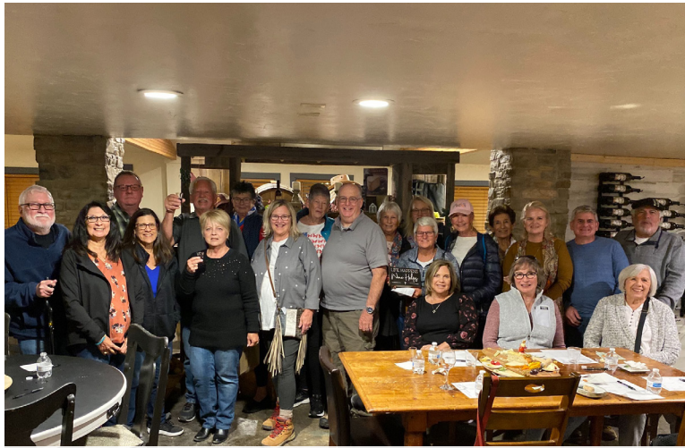
Brush Hallow Wine Tour