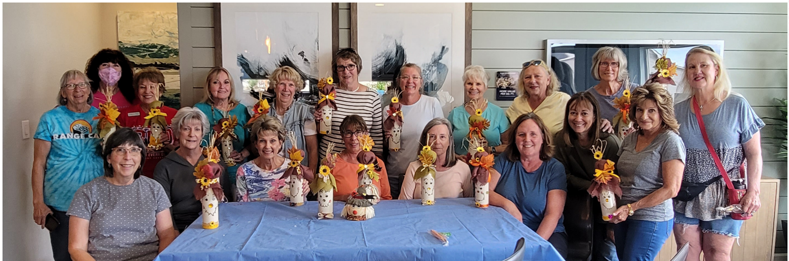
Craftastics Wine Craft