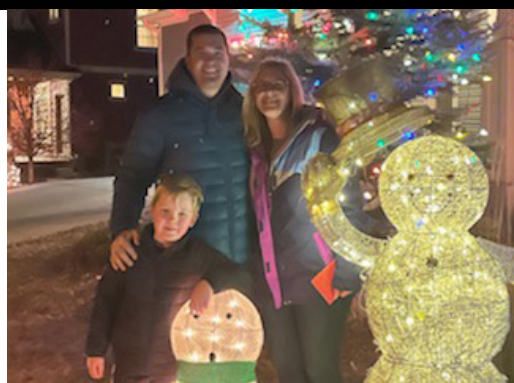
Third Place 2021, Newton Family