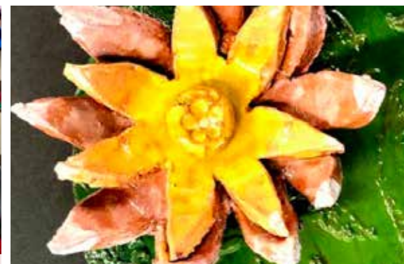
Winning artwork for "Best of Show"