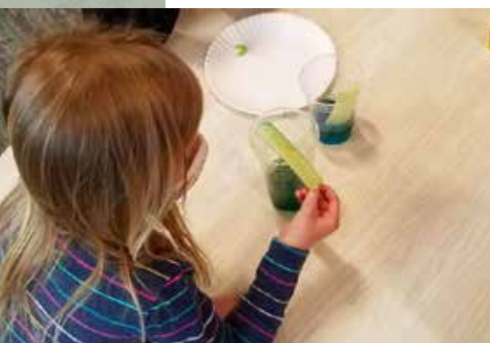
First graders enjoying the Cool Science Presentation

As our numbers continue to grow so does our excitement in planning for our 2021-2022 school year. IVES encourages families that are new to the neighborhood to register early so that our growing school is prepared for the 2021- 2022 school year. Have a great summer and we look forward to seeing you in August! 🍓