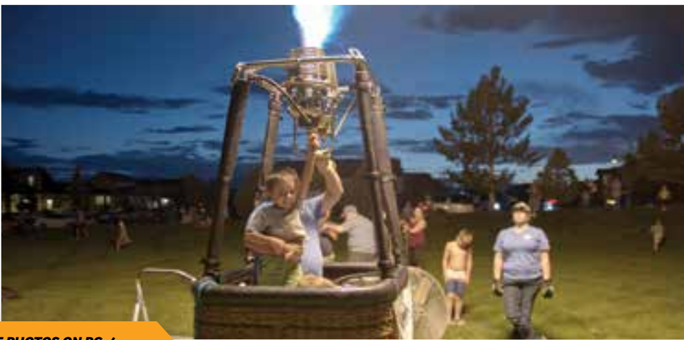
MORE PHOTOS ON PG. 4