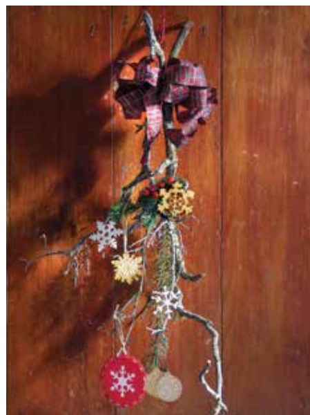
Snowflake ornaments made in PPLD's makerspaces.

As the holiday season nears, PPLD has guides to decorating the perfect table, cooking up a scrumptious feast, or creating affordable, meaningful gifts. Ask a staff member about finding these books (and eBooks!), or find these items online or in our mobile app. Use search terms like "holiday meal," "entertaining," "homemade gifts," or "decorating." Plus, find free holiday movies and songs for entertaining on our Cybershelf at ppld.org/cybershelf .