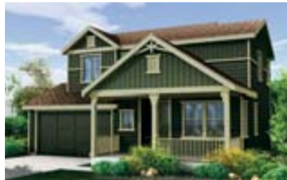
The Hawthorn Collection by Capital Pacific Homes