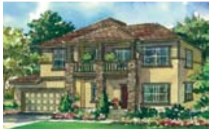
The Ashford Collection by John Laing Homes

Each Guest Builder has created all-new home designs for Northtree. In fact, each village is planned to have its own unique collections of homes. So as the community grows, it will become a colorful mosaic of individual neighborhoods. And with this full range of home styles, Banning Lewis Ranch should have something for just about every taste. Initial collections pricing expected from the low $200,000s to the low $300,000s.