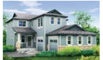
The Pinery Collection by Capital Pacific Homes

Architectural style and character reminiscent of long-established neighborhoods, with interiors designed for today's lifestyle: free-flowing spaces, luxurious master baths and all kinds of thoughtful details.