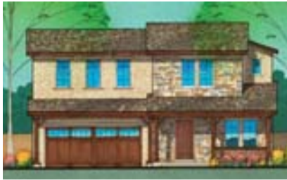
The Cherrydale Collection by Todays Homes