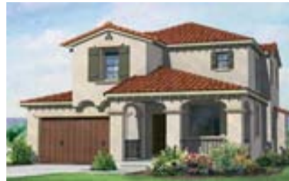
The Mapleton Collection by Classic Homes